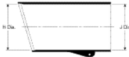
After Unrestricted Recovery (b)