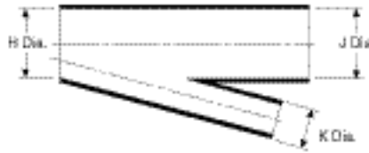
After Unrestricted Recovery (b)