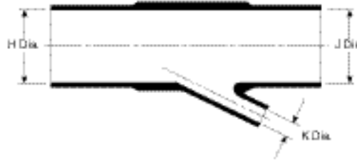
After Unrestricted Recovery (b)