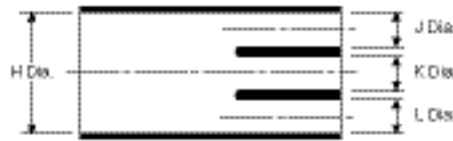
After Unrestricted Recovery (b)